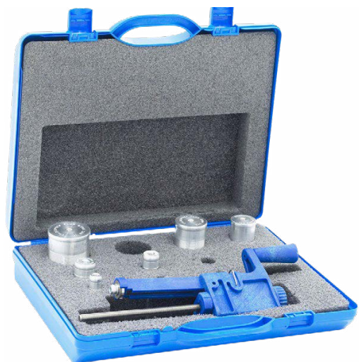
FIG. 1 Calderprep™ Plus Tool Kit