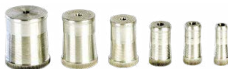
FIG. 3 Calderprep™ Plus Mandrel Inserts 20-25-32-40-50-63mm