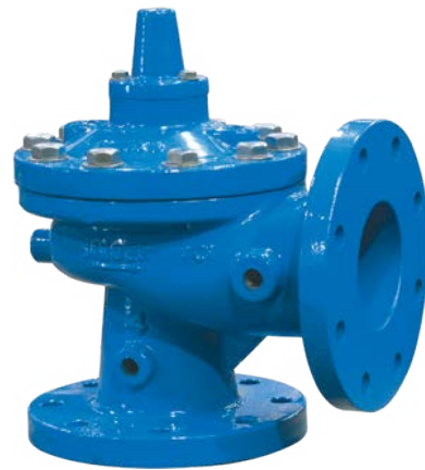
FIG. 1 Alternative models A206-PG Angle