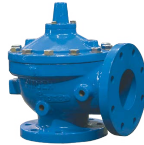
FIG. 1 Alternative model A106-PG Angle

Refer to the Singer Control Valve Sizing Calculator on our website for assistance.